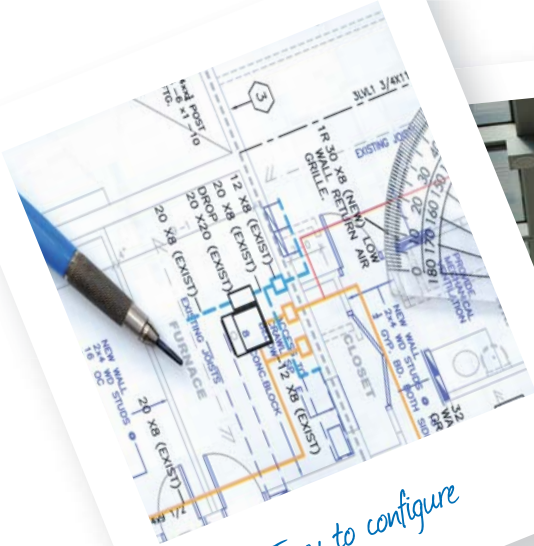
Easy to configure