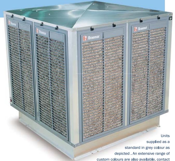
Units supplied as a standard in grey colour as depicted. An extensive range of custom colours are also available, contact your local representative for details.