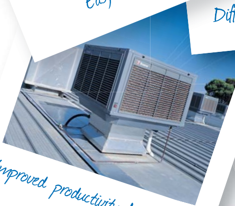
Improved productivity & OHS