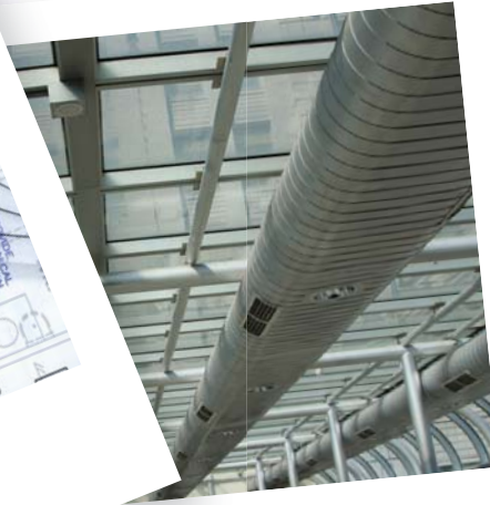
Difficult applications a specialty